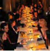
PRIVATE PR FUNCTIONS