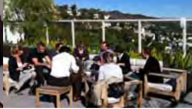
INKING THE DEAL AROUND THE POOL