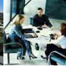
MEETINGS ARRANGED SIX WEEKS BEFORE MARKET